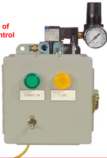
Example of simple control panel